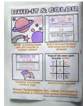
Turn activity, educational, and game sheets into fun and colorful learning tools.