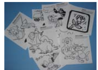
Rub the black and whites pages to reveal vibrant colors.

Coloring books can be used anywhere and anytime without the need of messy coloring tools.