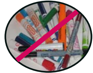
Coloring fun without the mess